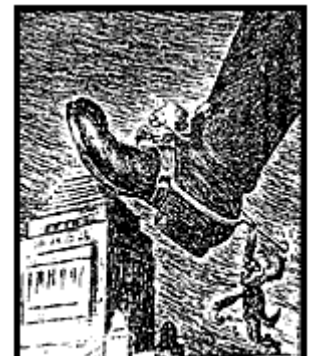
Warning of militarism in Japan – A soldier's boot is smashing the Diet Building in Japan; in other words, militarism is crushing parliamentary politics, and therefore democracy in Japan