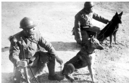
"Mukden Incident", 1931

In September 1931, a group of Japanese officers stationed in a part of Manchuria under lease to Japan blew up a section of railroad near the city of Mukden, then blamed the act on troops of the Chinese warlord who controlled the area. Using this "Mukden Incident" as an excuse, the Japanese officers directed their